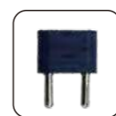
Multi-function Test Bench